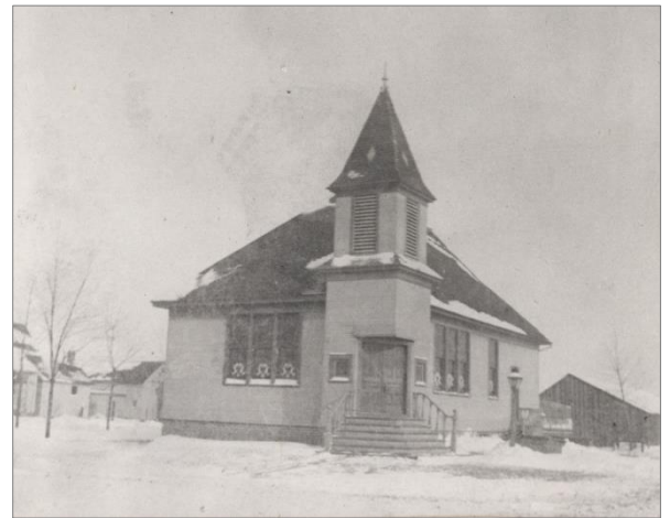
Our Fourth Building (above) was destroyed by fire (below).

In 2002 we celebrated our 165 th anniversary.