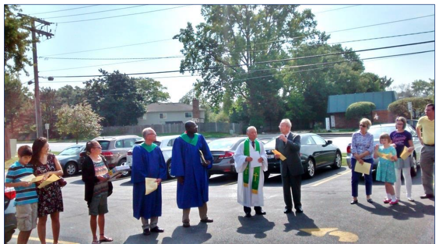
Parking lot dedication, Sept. 25, 2016.