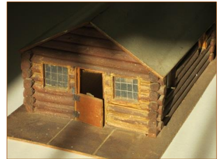
A model of our First Building.