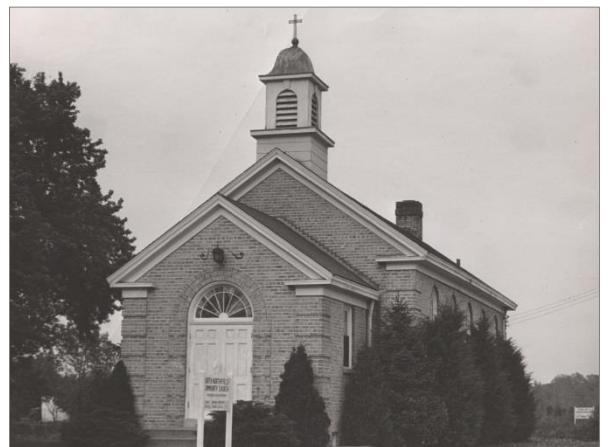
Our Fifth Building.