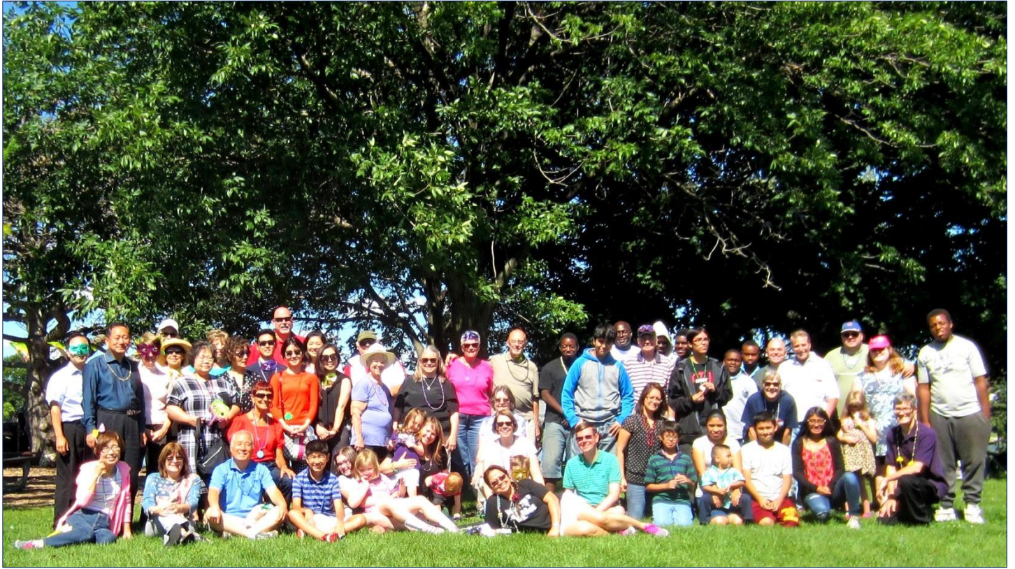
Rally Day Picnic, September 2016