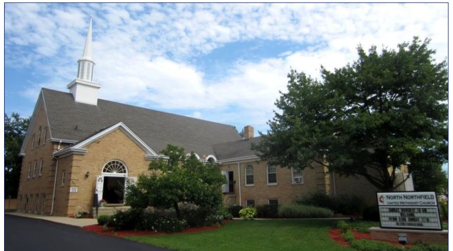
Our current building.