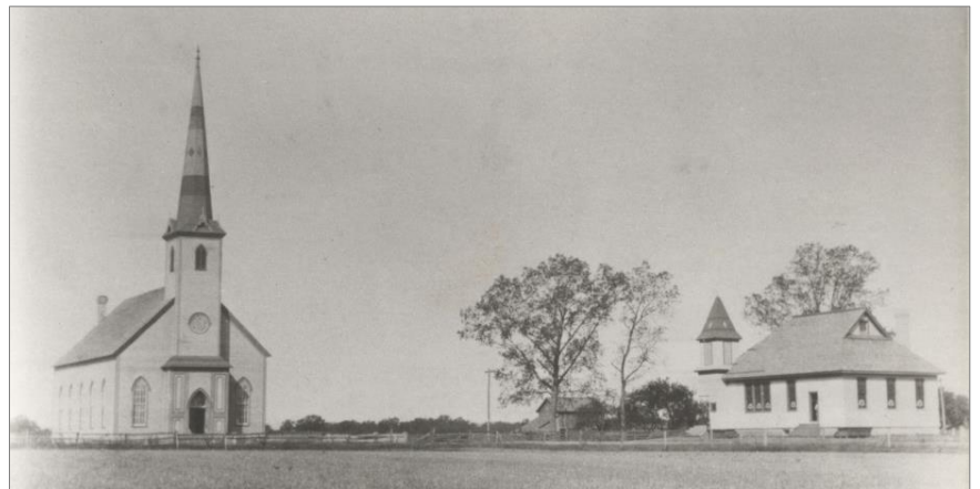
Our Third and Fourth Buildings.