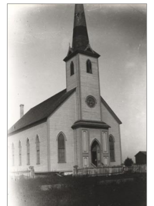
Our Third Building.

In 1847 the second church, 50' by 70' with an 18' ceiling, was erected on the Nicholas Miller farm (northwest corner of Dundee and Sanders). The Pioneer Cemetery, containing 125 or more burials, was located directly behind the building to the west. Over the years, most of the markers have been destroyed or removed. This second building was later dismantled and its timbers used to build a barn in Wheeling.